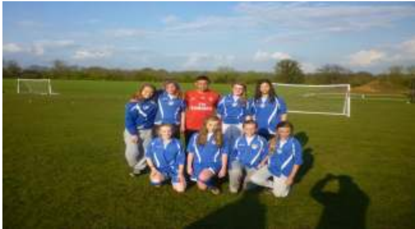
Azzurri U15s Girls with Arsenal & England player Alex Oxlade-Chamberlain

NCFootball aim to make our Girls Development Centre the most welcoming, progressive and interactive girl's football centre in the County. All girls will have the chance to receive professional coaching on a weekly basis, opportunities to be selected for NCFootball Girls Festival teams and ultimately be selected to play for Barnet Azzurri FC.